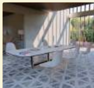
3D Projects Guided of B.Sc(Animation) Student