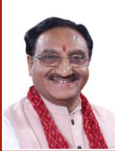
Dr. Ramesh Pokhriyal 'Nishank' Hon'ble Minister of HRD

Smart India Hackathon is a non-stop product development competition