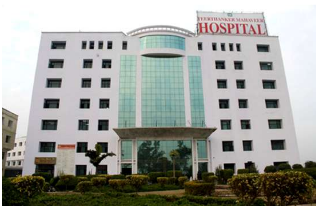
NEW BUILDING OF TEERTHANKER MAHAVEER HOSPITAL