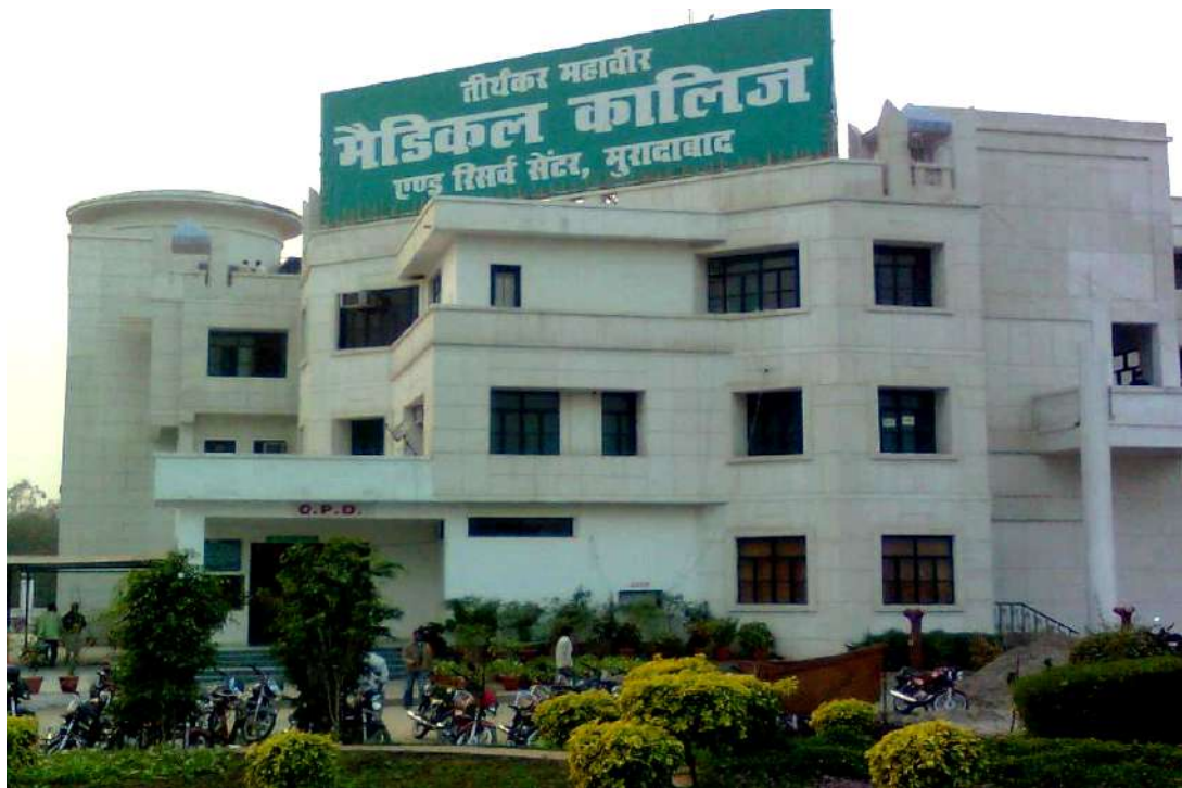
OLD BUILDING OF TEERTHANKER MAHAVEER HOSPITAL