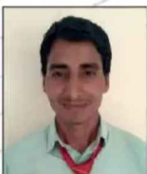
Raj Shiv Advertising