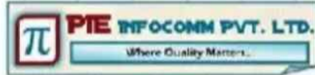
Injila Marium Pie Infocom