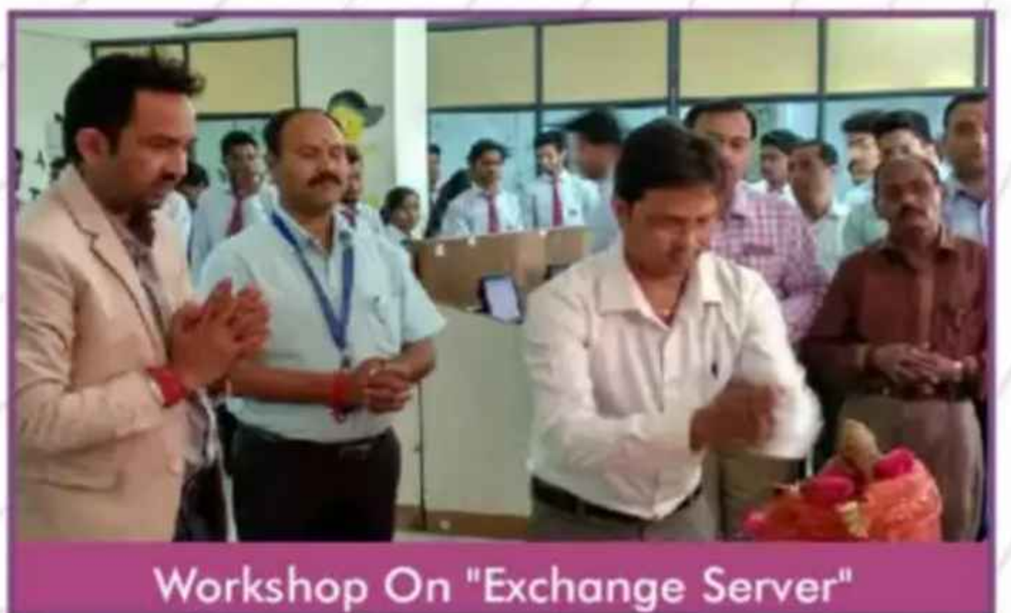
Workshop On "Exchange Server"