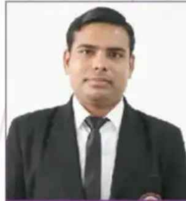
MOHD JAVAID CLOUD COMPUTING