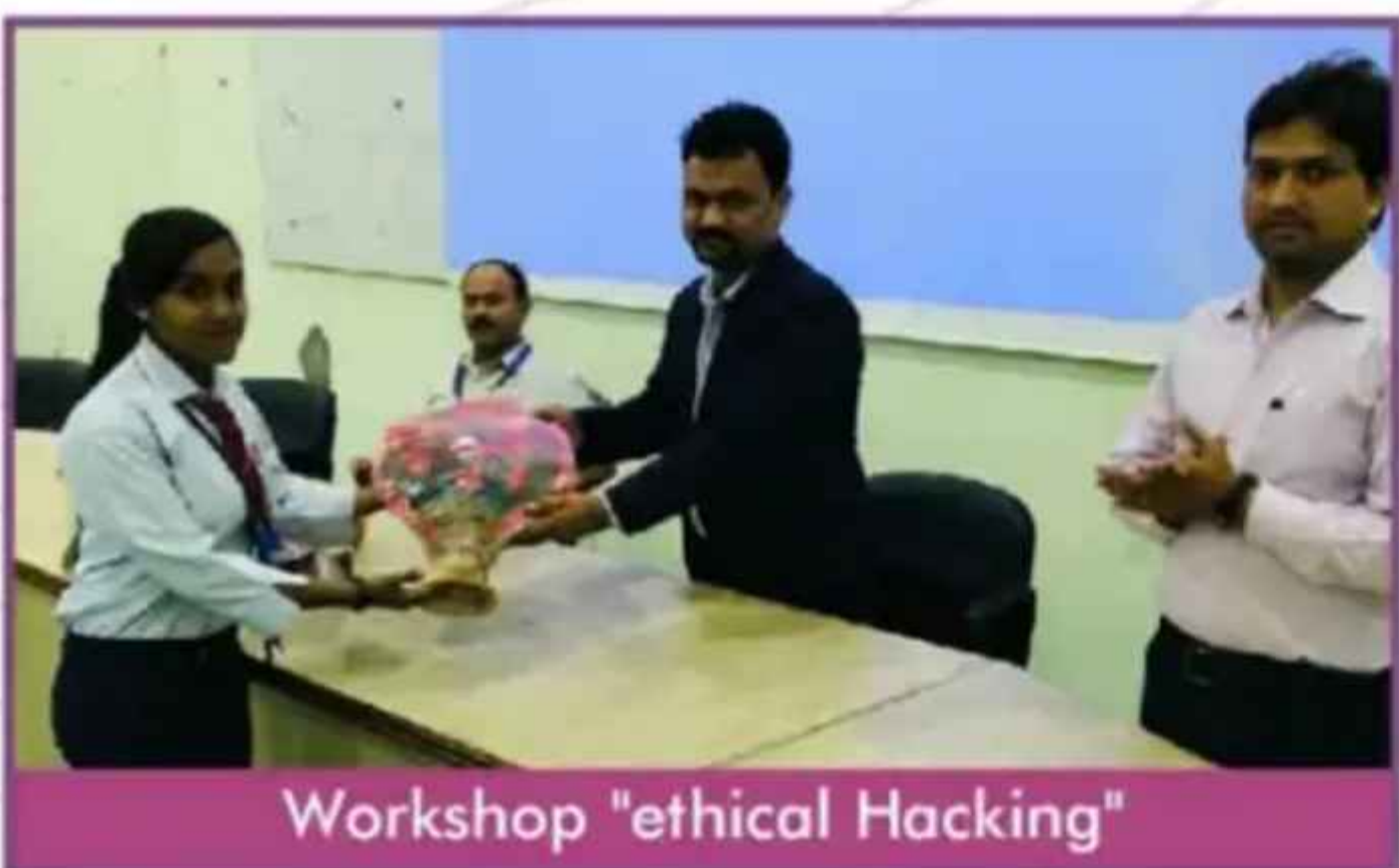
Workshop "ethical Hacking"