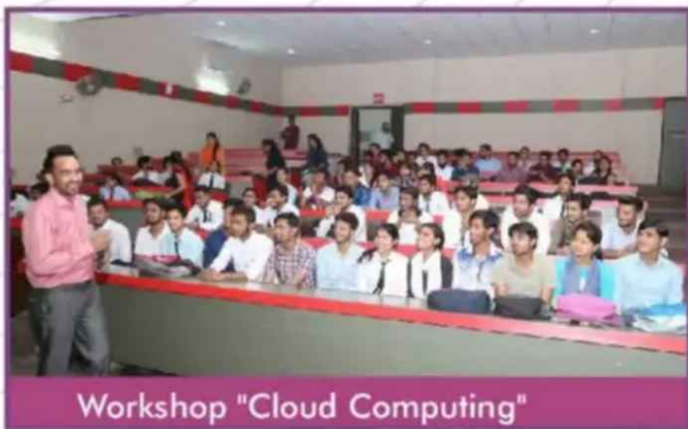
Workshop "Cloud Computing"