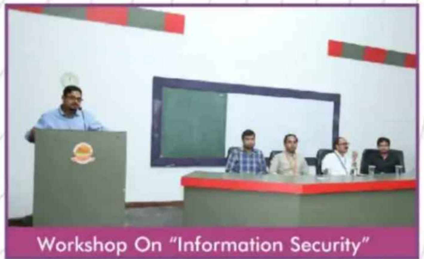
Workshop On "Information Security"