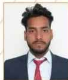
NS International School