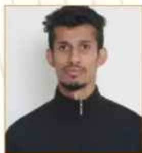
Parax Jain PHP