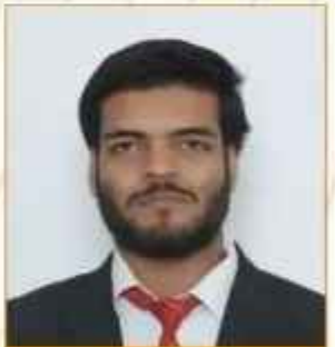
Jain Jain IOT