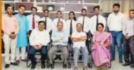
टीएमयू के कैम्पस प्लेसमेंट में चयनित विद्यार्थी और शिक्षक।