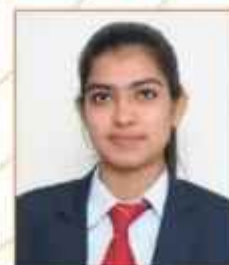
Shivam Jadon NS International School