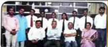
सीसीएसआईटी के 21 विद्यार्थियों को नौकरी मिली।