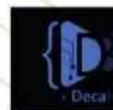
Shubham Jain Decabits Software