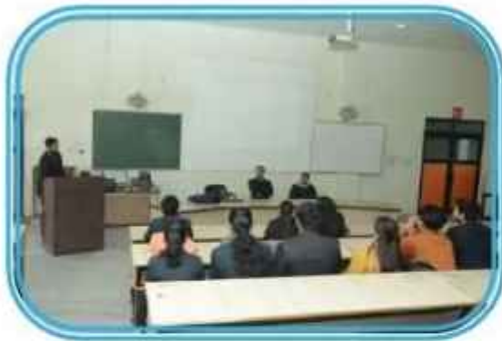
Microdot Tech Aspire