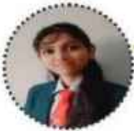
INMOVIDU Diksha Inmovidu Tech