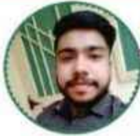
Chegg CapitalVia Raghav Sikka Chegg India & CapitalVia