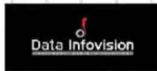
Isha Jain Data Infovision