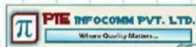
Sourabh Jain Pie Infocom