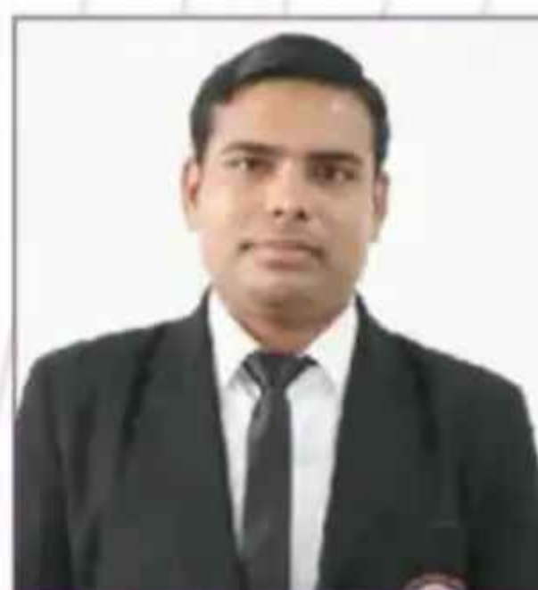
MOHD JAVAID CLOUD COMPUTING