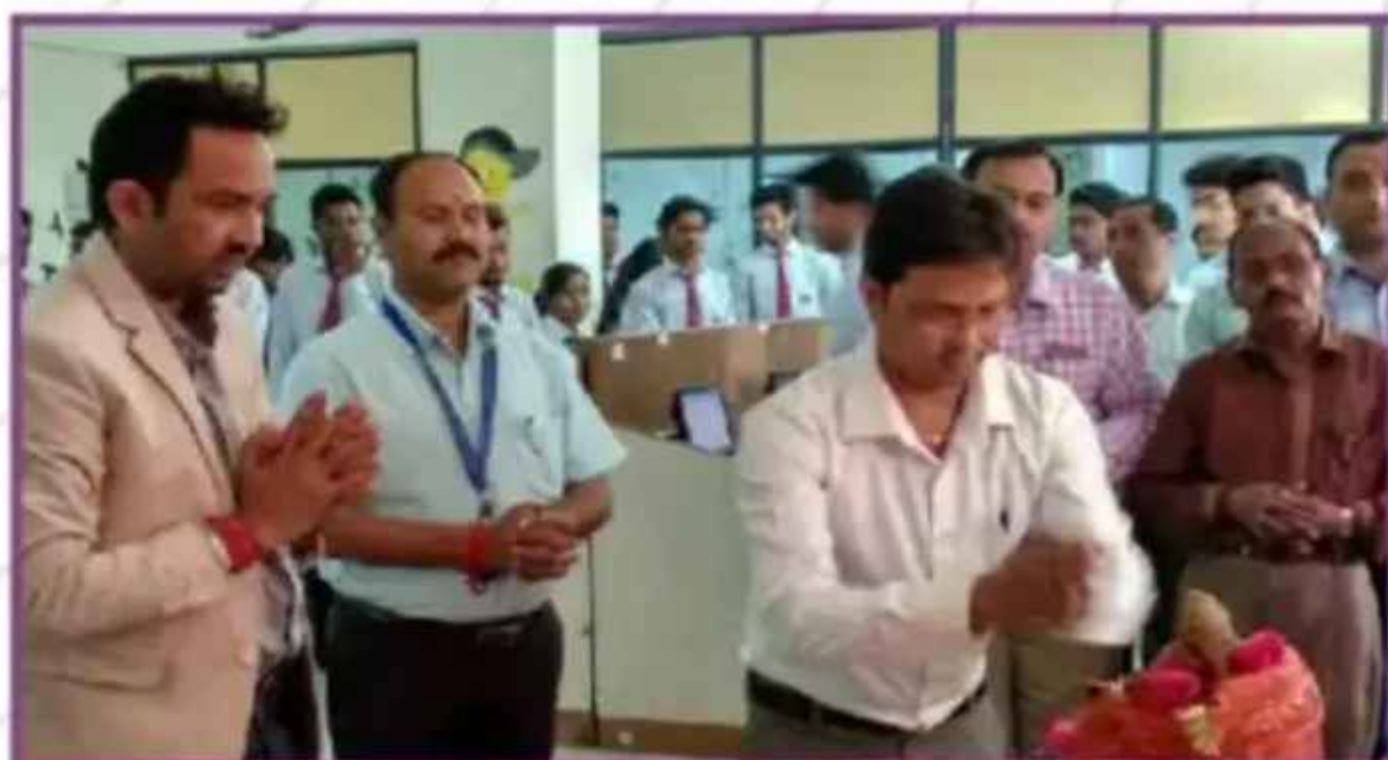
Workshop On "Exchange Server"