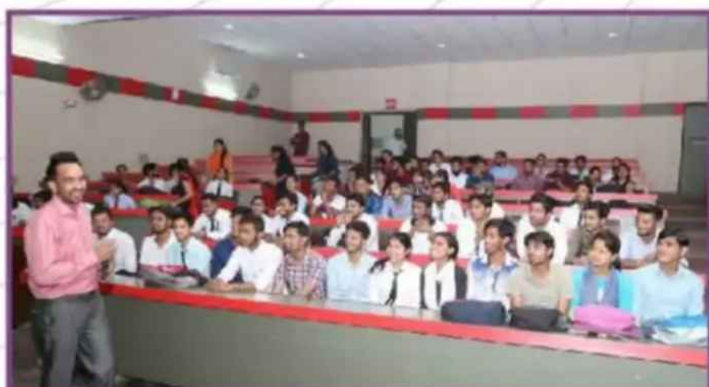
Workshop "Cloud Computing"