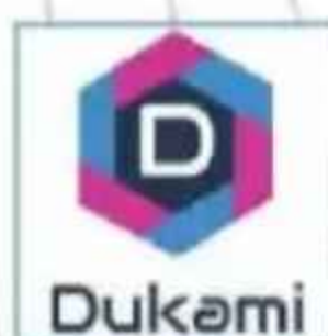
Dhurub Saxena Dukami Enterprises