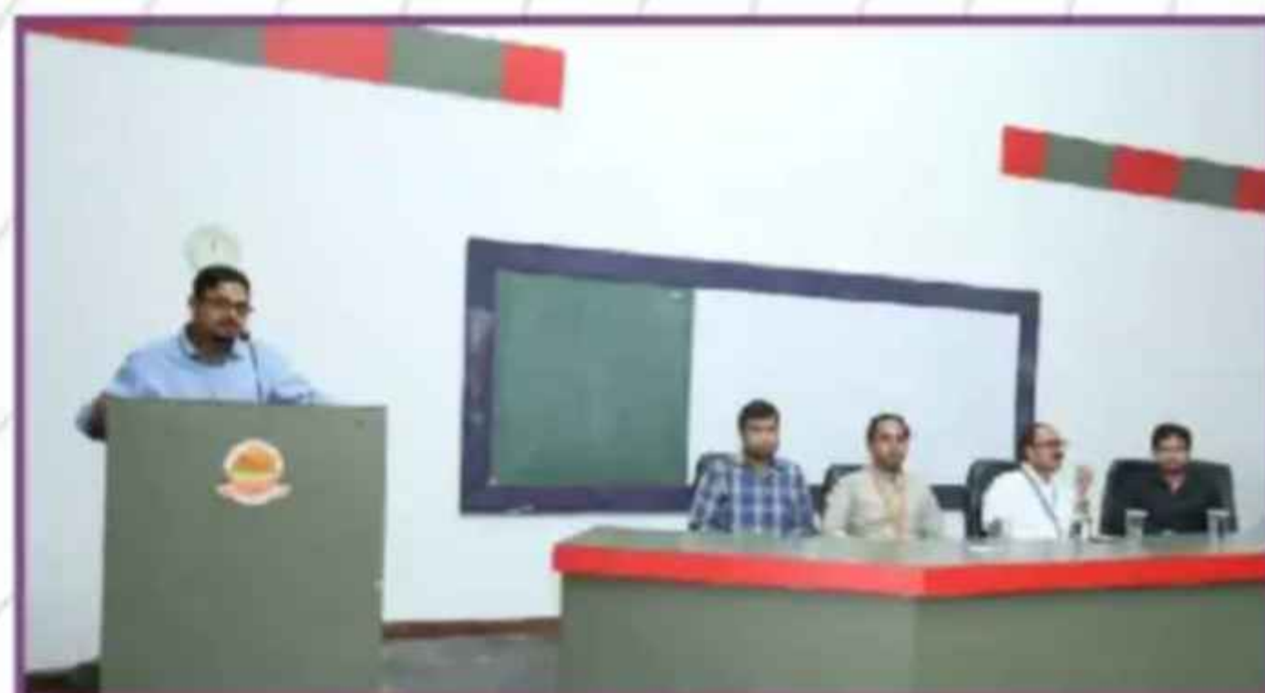
Workshop On "Information Security"