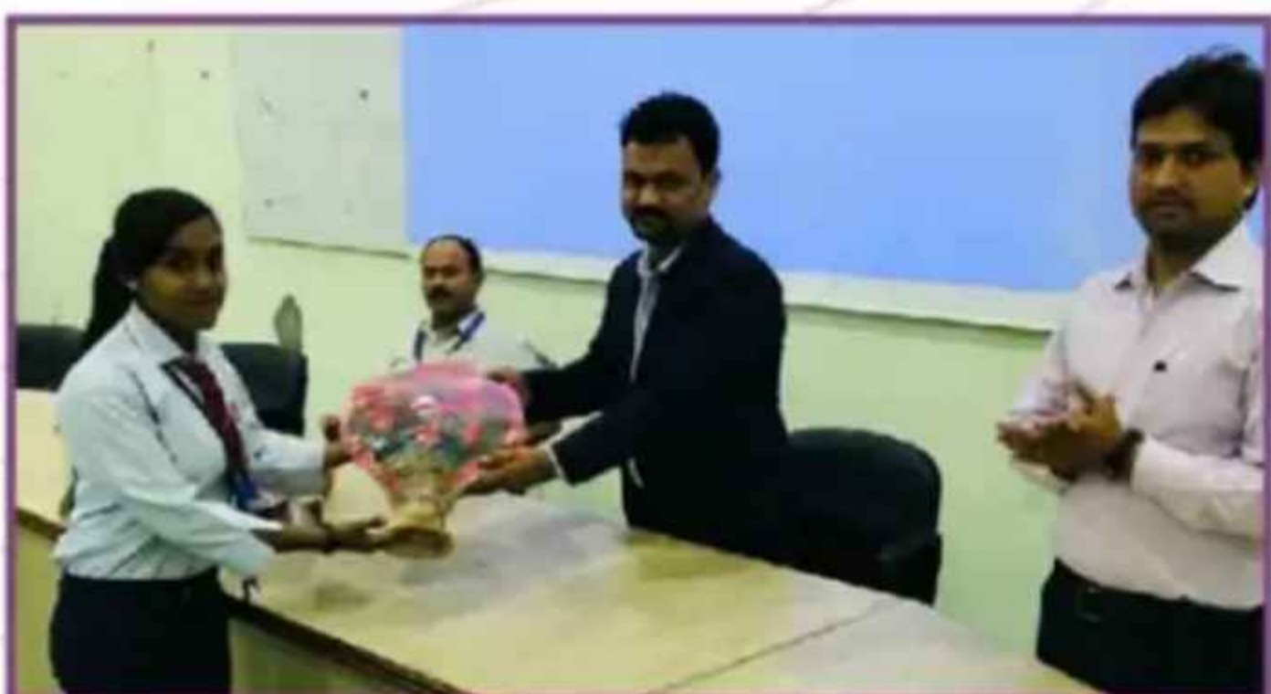
Workshop "ethical Hacking"