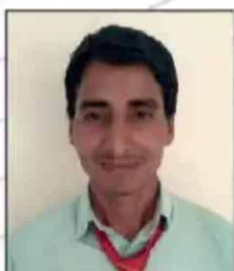
Raj Shiv Advertising