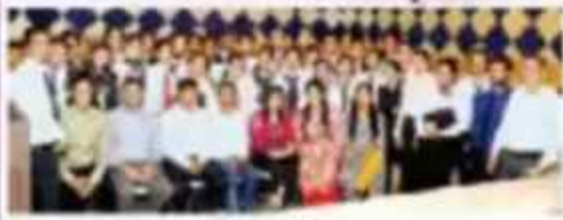
टीएमयू के 28 छात्रों का चयन हुआ। छात्रों को संस्थान की ओर से उज्ज्वल भविष्य की शुभकामनाएं दी गईं।

मुरादाबाद। टीएमयू में कैम्पस रिक्रूटमेंट के अंतर्गत भीलवारा ग्रुप के छात्र-छात्राओं का चयन किया गया। छात्रों ने लिखित परीक्षा के साथ ही साक्षात्कार में अपनी प्रतिभा का परिचय दिया। बीटेक के 284 छात्र-छात्राओं ने प्रतिभाग किया। अंतिम रूप से कुल 28 छात्र-छात्राओं का चयन हुआ। छात्रों को संस्थान की ओर से उज्ज्वल भविष्य की शुभकामनाएं दी गईं।