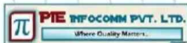
Injila Marium Pie Infocom