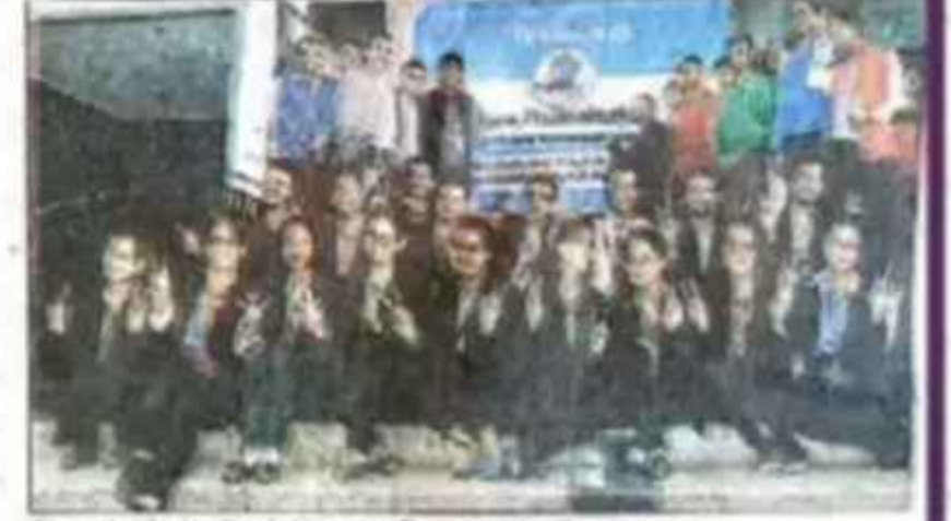
टीएमयू के 21 विद्यार्थियों का चयन हुआ। छात्रों को संस्थान की ओर से उज्ज्वल भविष्य की शुभकामनाएं दी गईं।